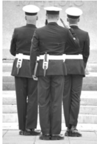
The changing of the guard at the Tomb of the Unknown Soldier, Ottawa, 2008.